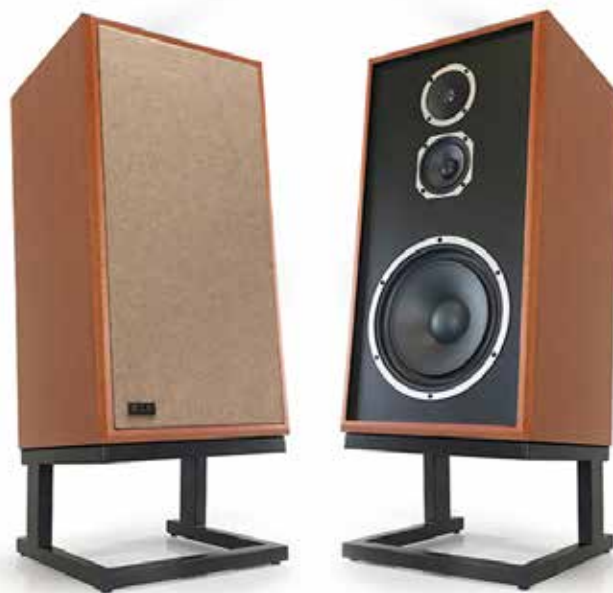
Shown in West African Mahogany SKU#: KLHF00060

Stonewash Linen Grille available by special order Basalt Black Knit Grille available by special order