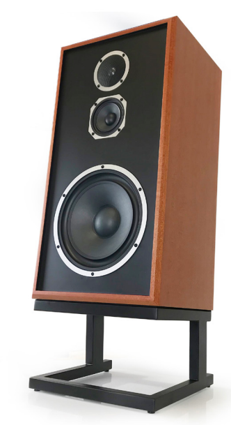
Shown in West Afican Mahogany