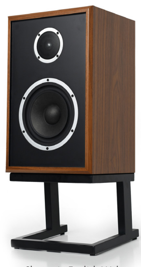
Shown in English Walnut